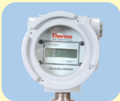
Thermo Scientific Sarasota HME900