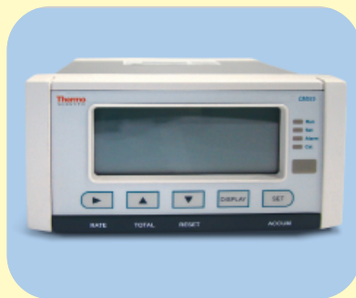
Thermo Scientific Sarasota CM515